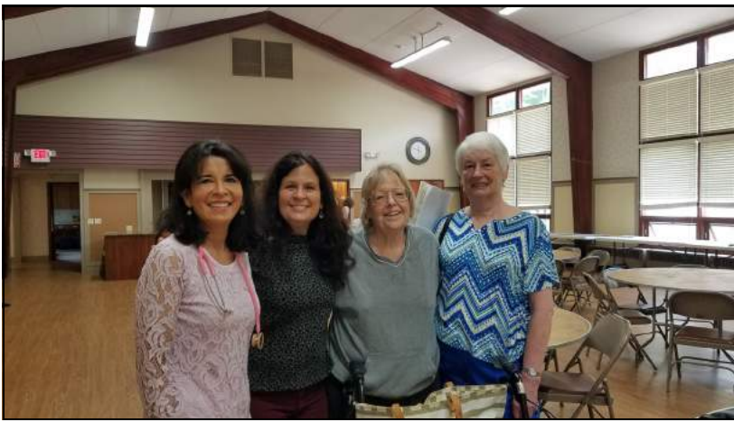
At Fellowship after 10:00 am Service