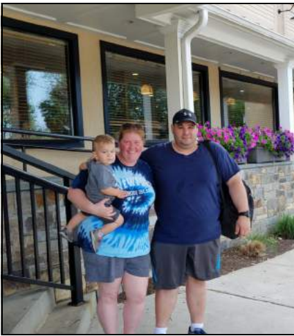
DeNeutte Family in South Carolina