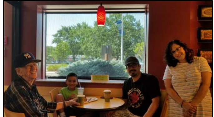
At Panera Bread