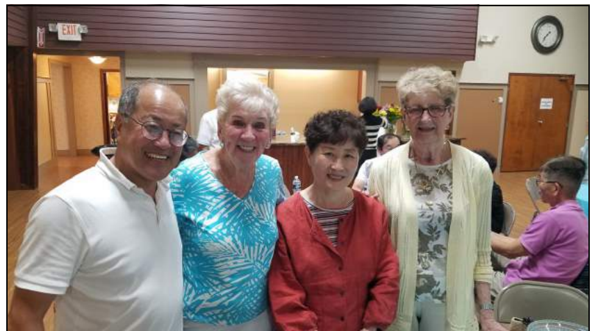
At Open House after Golf Outing—Aug 25