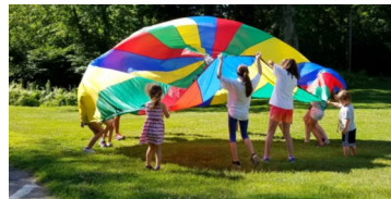
Vacation Bible School June, 2017