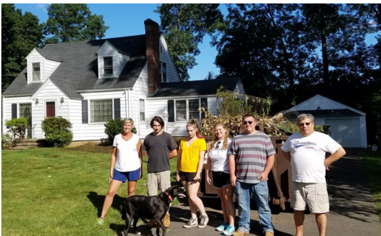
Parsonage Project ~ August , 2017