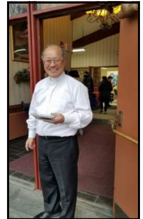
Distributing ashes to Nursery School families

As our faith journey continues, we hear the voice from heaven, “This is my Son, whom I love. With him I am well pleased. Listen to him!” (Matthew 17:5) What do you hear lately? People in the Bible heard God during their faith journey. “Make yourself an ark of cypress wood” (Genesis 6:14, 19) “Go from your country, your people and your father’s household to the land I will show you.” (Genesis 12:1) “Go now. I am sending you to Pharaoh to bring my people the Israelites out of Egypt.” (Exodus 3:10) “Get ready to cross the River Jordan into the land I am about to give.” (Joshua 1:1) “Whom shall I send? And who will go for us?” (Isaiah 6:8a) “Before I formed you in the womb I knew you, and before you were born I consecrated you.” (Jeremiah 1:5) “So do not fear, for I am with you; do not be dismayed, for I am your God. I will strengthen you and help you; I will uphold you with my righteous right hand.” (Isaiah 41:10) “You did not choose me, but I chose you.” (John 15:16) “Where are you?” (Genesis 3:9) “Where is your brother Abel?” (Genesis 4:9) “Do you love me?” (John 21:15ff) “Were not all ten cleansed? Where are the other nine?” (Luke 17:17) God still speaks today.