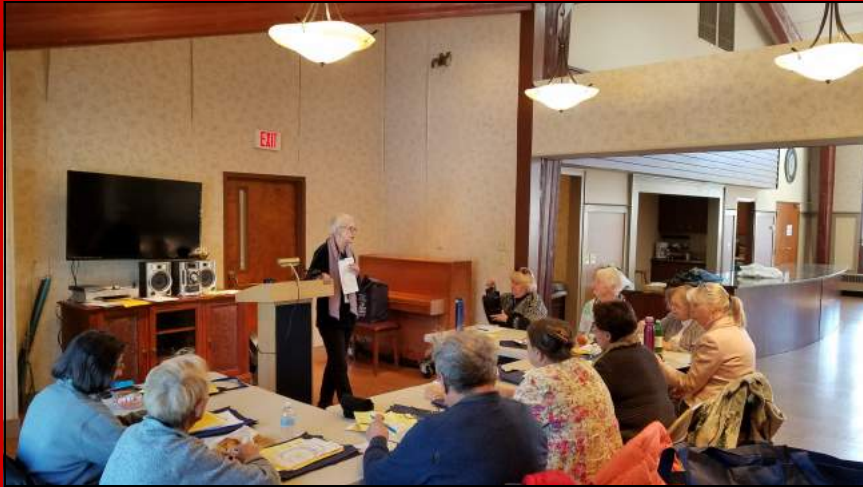
Session on Medicare 2020