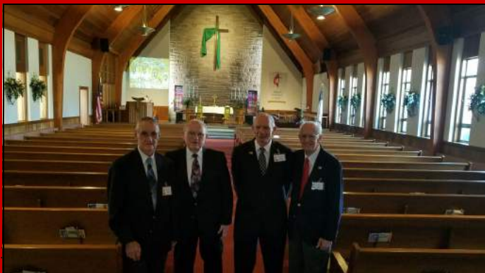
Our wonderful and faithful ushers.