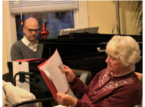
Caroling at Parish Court