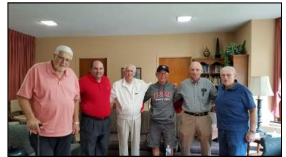
New Ministry forming—MOP Ministry of Presence