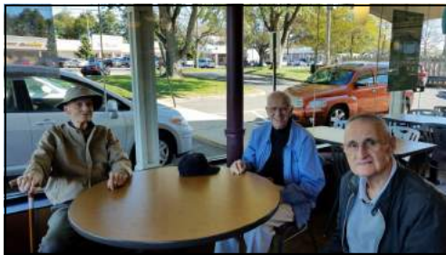
Out and about...