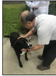
Blessing of the Animals October, 2018