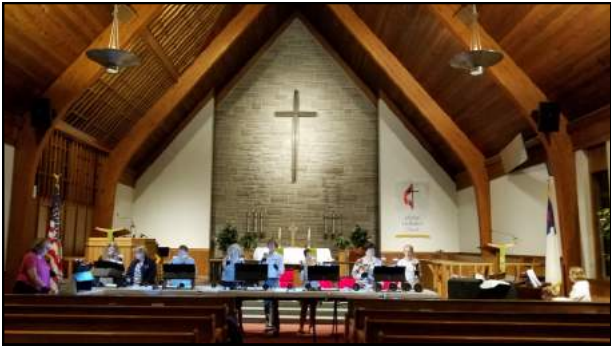
Bell Choir October, 2018