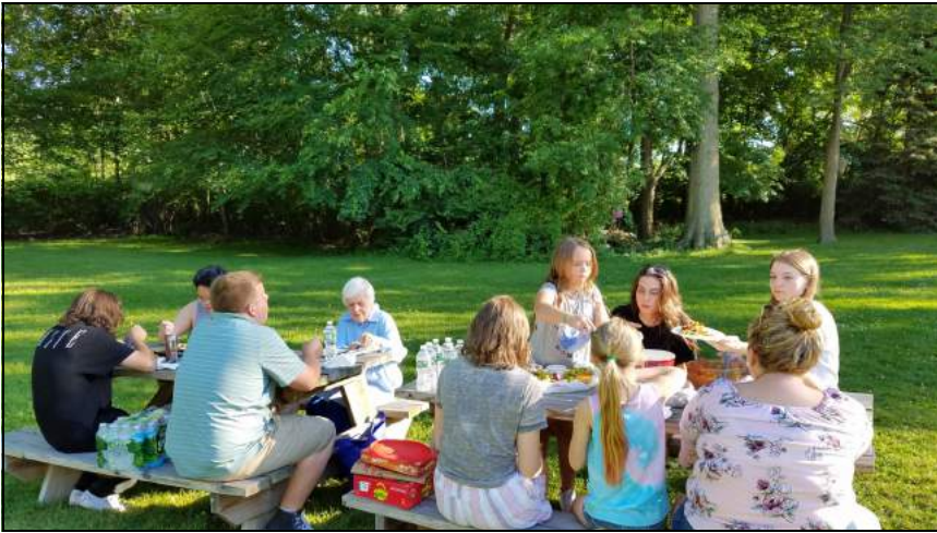
“exuberant” Circle Reunion Picnic