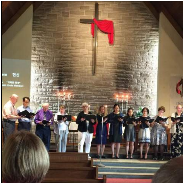
Fairfield Grace Anniversary Service and Luncheon