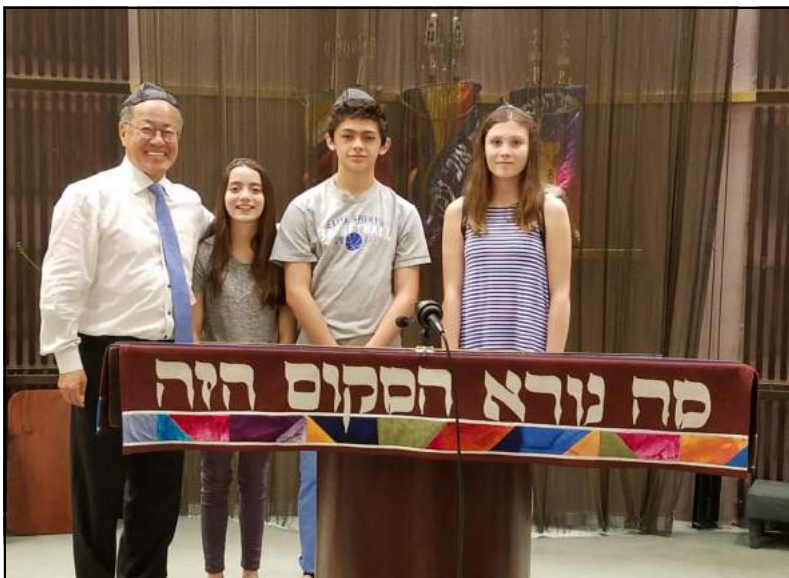
Confirmation Class Visit to Temple Beth-El