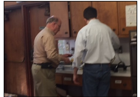
Breakfast with the Easter Bunny Saturday, March 24