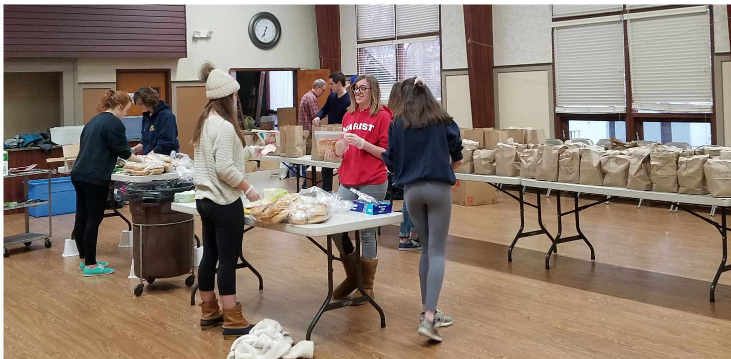
Fairfield Grace youth preparing for their Annual Midnight Run