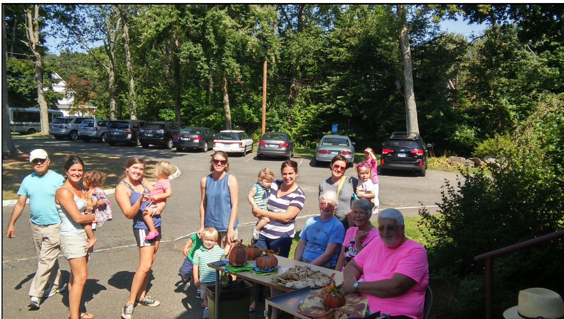
Fairfield Grace Members welcoming Nursery School families on the first week of classes with baked treats