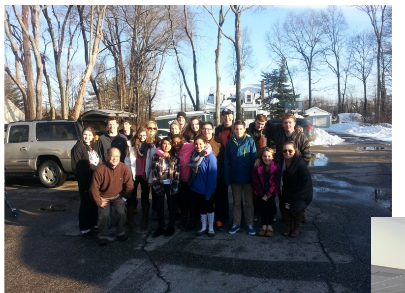
The group departing Fairfield Grace

Fairfield Grace's Youth Group Winter Retreat/Ski Trip 2015 February 20-22 Camelback Mountain Tannersville, PA