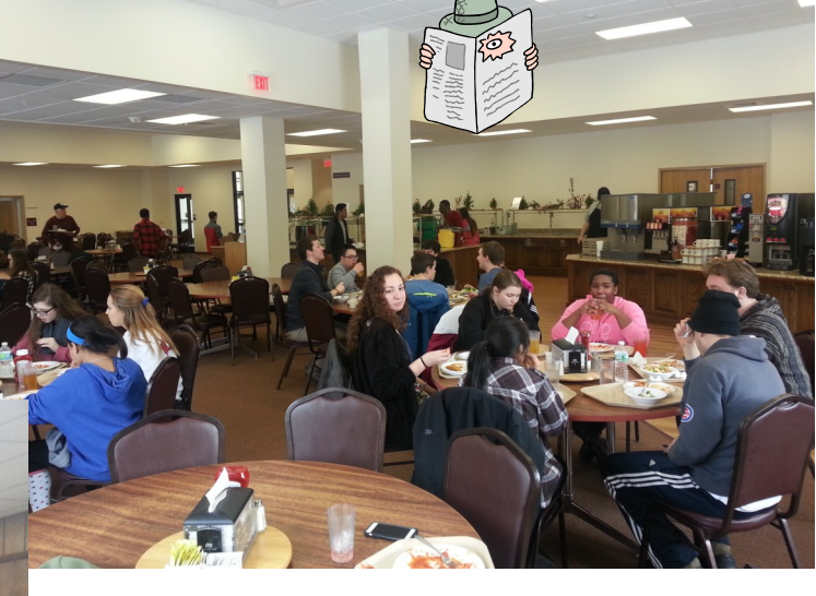
Spruce Lake Retreat Center

Fairfield Grace's Youth Group Winter Retreat/Ski Trip 2015 February 20-22 Camelback Mountain Tannersville, PA